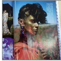
Vogue Dec 2018