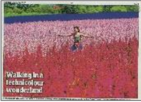
Daily Mail 11.07.15