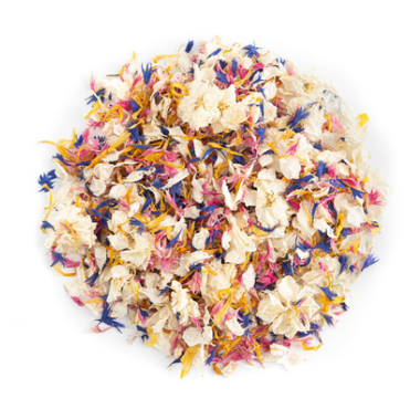
Lovely Mix Delphiniums & Wildflowers