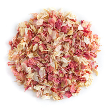
Pink Mix Delphinium Petals

On "average" (every wedding is unique!) 50 - 100 handfuls of confetti will be thrown.